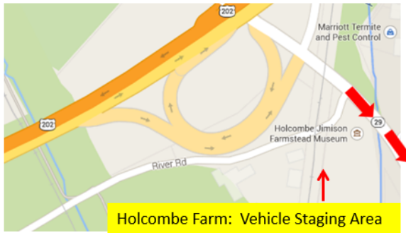
Holcombe Farm: Vehicle Staging Area